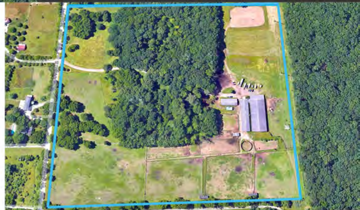
Median Sold Price By Bedroom Count (source ROCKET HOMES)